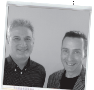
Sutherland & Barnett

Sutherland & Barnett was formed in 2006 as an individual, independent hairdressers in Nottingham that focuses purely on the customer. The Sutherland & Barnett team are provided with the very best ongoing training and have become an award-winning salon, winning the prestigious British Hairdressing Business Awards, L'Oréal Young Talent Award, The Hair Awards' Talent Scout and Heart FM Salon of the Year.